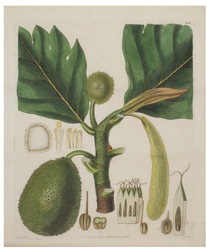
Breadfruit Scientific Drawing.

Late Work: Stuff happens. Sometimes life takes priority over school work. If something comes up and you need to miss a class or cannot turn in an assignment let me know immediately. I do not always grant extensions on assignments, but I do try to be flexible. It is imperative, therefore, that when incidents arise you do your diligent best to keep me informed.